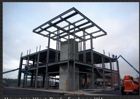
Mountain West Bank, Spokane WA, 2007, Detail