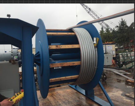
I-90 Floating Bridge Cable Replacement Powered Wire Spools, 2018, Design Build