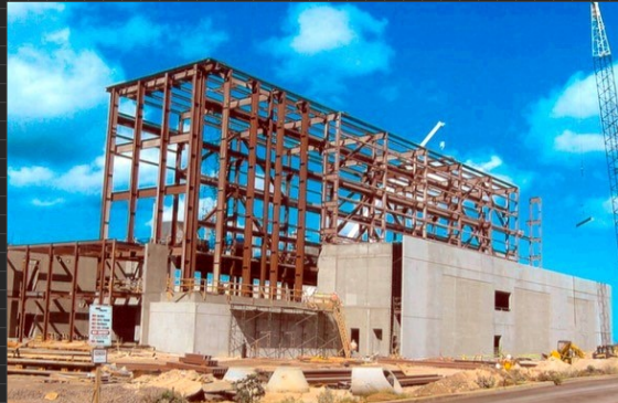
Honolulu Advertiser, 2005, Project Management